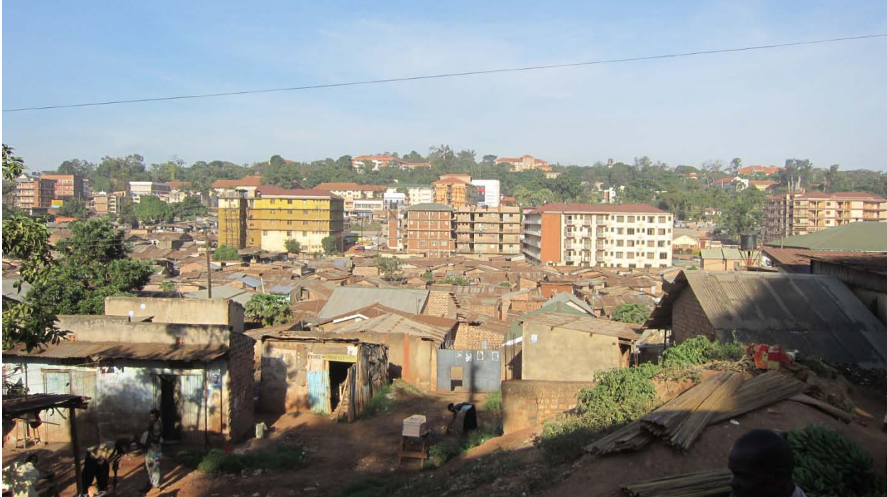
Kampala shantytown and high-rise flats