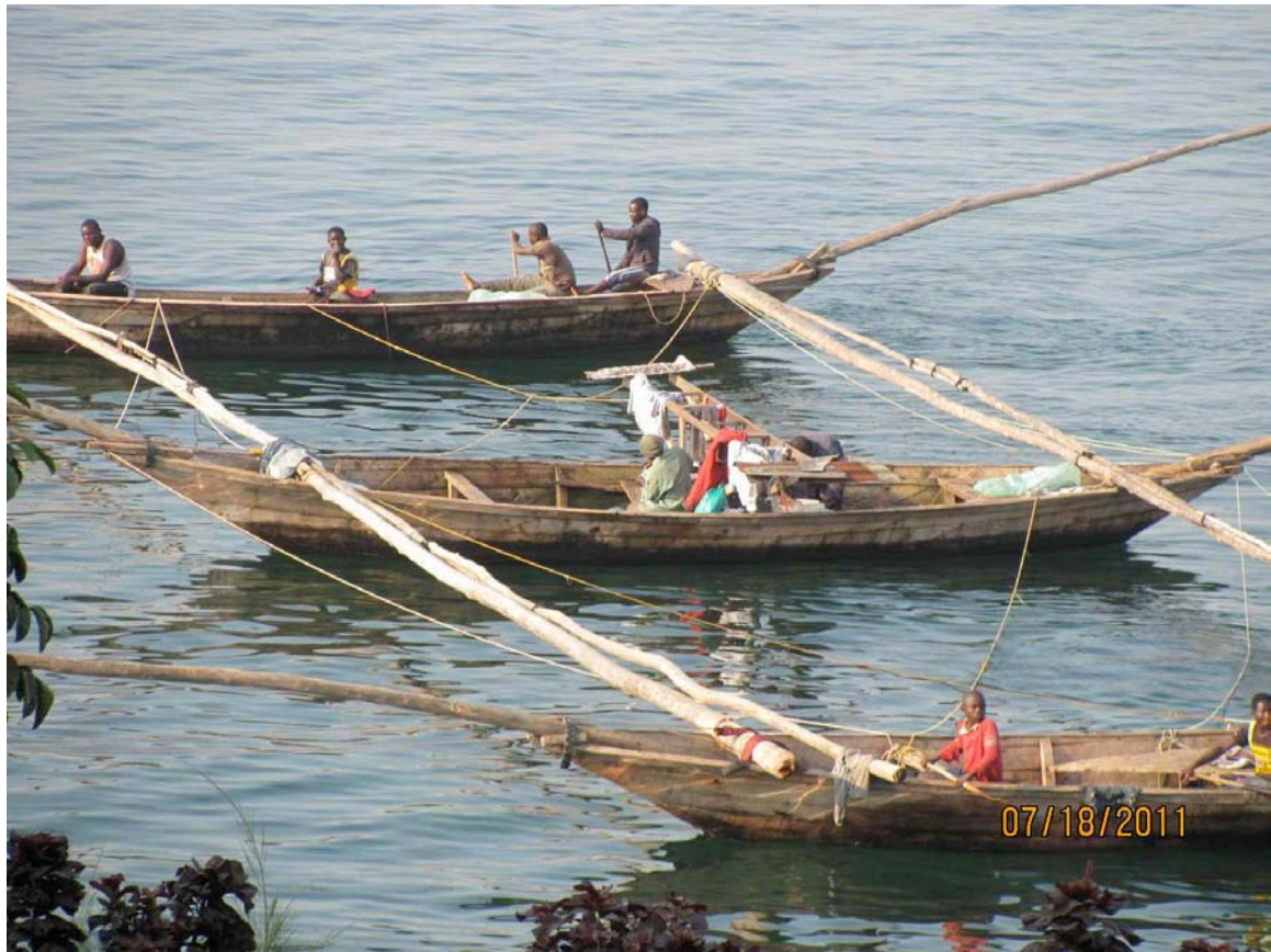
Kawaida Fishing Group on Lake Kivu, North Kivu

In South Kivu, former combatants established the Action Communautaire pour le Développement de Kalundu (ACDK) in Uvira in 2008. They subsequently approached several potential donors for assistance and eventually received support from national DDR programme through Caritas, an international NGO. This financial support enabled ACDK to buy fishing nets and a piroque (canoe), which they used to fish on Lake Tanganyika. They would fish overnight and sell the bulk of their catch at the port of Kalimabenge (Uvira) the following morning. A small portion of the catch was reserved for family consumption, and was shared equally among the families. 93