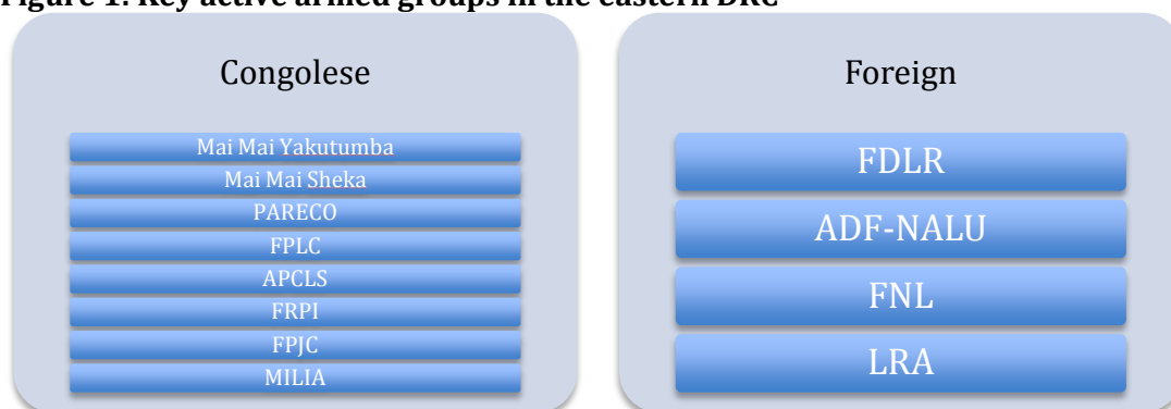
Figure 1: Key active armed groups in the eastern DRC

These armed groups have been able to sustain themselves by three main sources: (i) extracting resources and income through the control of mining operations, as well as transport links from the mining areas to urban centres; (ii) engaging in illicit activities, such as smuggling, looting and extortion; and (iii) sourcing external funding (remittances from diasporas and state sponsorship). Some recent examples are outlined below.