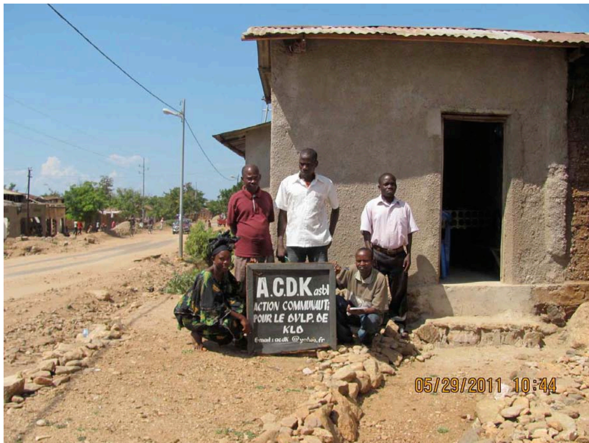
ACDK representatives in front of their office

The ACDK also opened a bank account with COOPEC, into which they deposited their savings. The advantage was that COOPEC administered a micro credit facility that ACDK members could access on relatively favourable terms. The savings account also came handy during the Saison Ndenga , when the moon is too bright to effectively fish at night. Consequently, fish catches are substantially reduced, with ACDK barely being able to acquire sufficient fish for their own subsistence during this period. 95